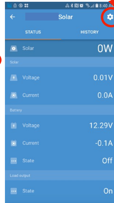
MPPT Charge Controller Screen