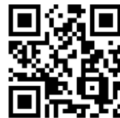
SOLAR PANEL INSTALLATION VIDEO