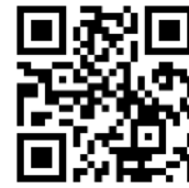
ROOF COMBINER BOX INSTALLATION VIDEO