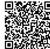
If the connections seem tight on the MPPT, that is normal. Scan here for assistance.